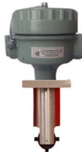
Flameproof Flow Sensor