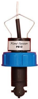
PP Sensor Rod

These Digital Flow Transmitters are available in Panel mounted version (model P383) and Field mounted version (model F383). The standard output from Transmitter is 4 to 20 mA, but we can also provide 2 to 10 VDC, RS232 or, RS485. Programmable scale factor with direct flow rate reading in M3/hr / LPH / LPM / LPS / GPMus / GPMuk, and totalizer reading in m3 / Liters / Gallon is available in these series of Flow Transmitters. This model has optional Relay output which can be provided to operate on Totalizer (used for Batching and Dosing application) or, on rate of flow (used as flow switch).