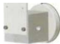
Gauge Wall Mounting