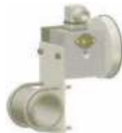
Gauge + Switch (With DIN plug)