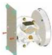
Gauge (Surface Mounting)