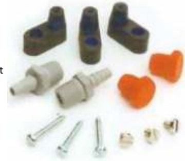
Accessories supplied with the instruments