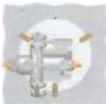
Gauge (Flush /Panel Mounting)