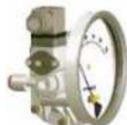
Gauge + Switch (With DIN plug on top)