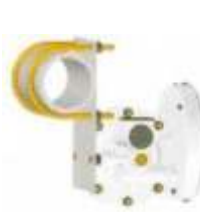
2" Pipe Mounting